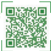
Presentation pod – Pattern on Demand®

Gertsch Consulting & Mode Vision has been your partner in the fashion and apparel industry since 1997. The topic of «mass customisation» and «fashion on demand» has been a field of activity of ours since 2008. Through joint and interdisciplinary cooperation with our customers and partners, we created the pod – Pattern on Demand® platform for manufacturers and suppliers of customised made-to-measure clothing in 2012. pod – Pattern on Demand® is constantly being improved and is in use throughout Switzerland and internationally.